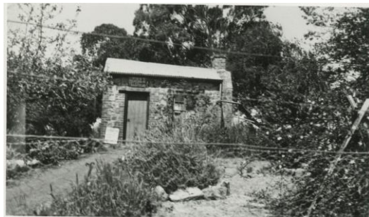
Photograph: Inman Valley Post Office (circa 1920).

Bookings: festival.history.sa.gov.au/5256