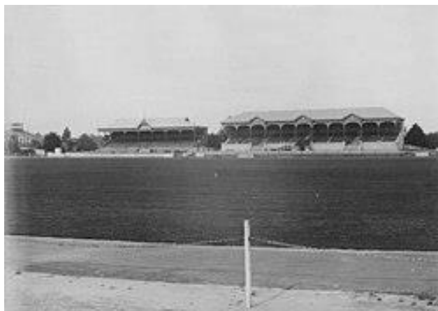
Photograph: Adelaide Oval (circa 1900).

Bookings: festival.history.sa.gov.au/5663