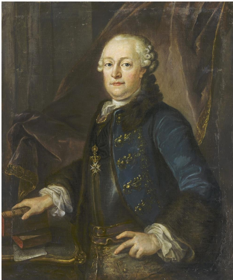
Photograph: Charles Pierre Claret de Fleurieu.

Bookings: festival.history.sa.gov.au/5327