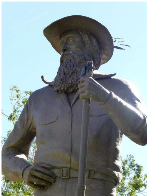
Photograph: John McDouall Stuart Statue in Victoria Square.

Bookings: festival.history.sa.gov.au/5358