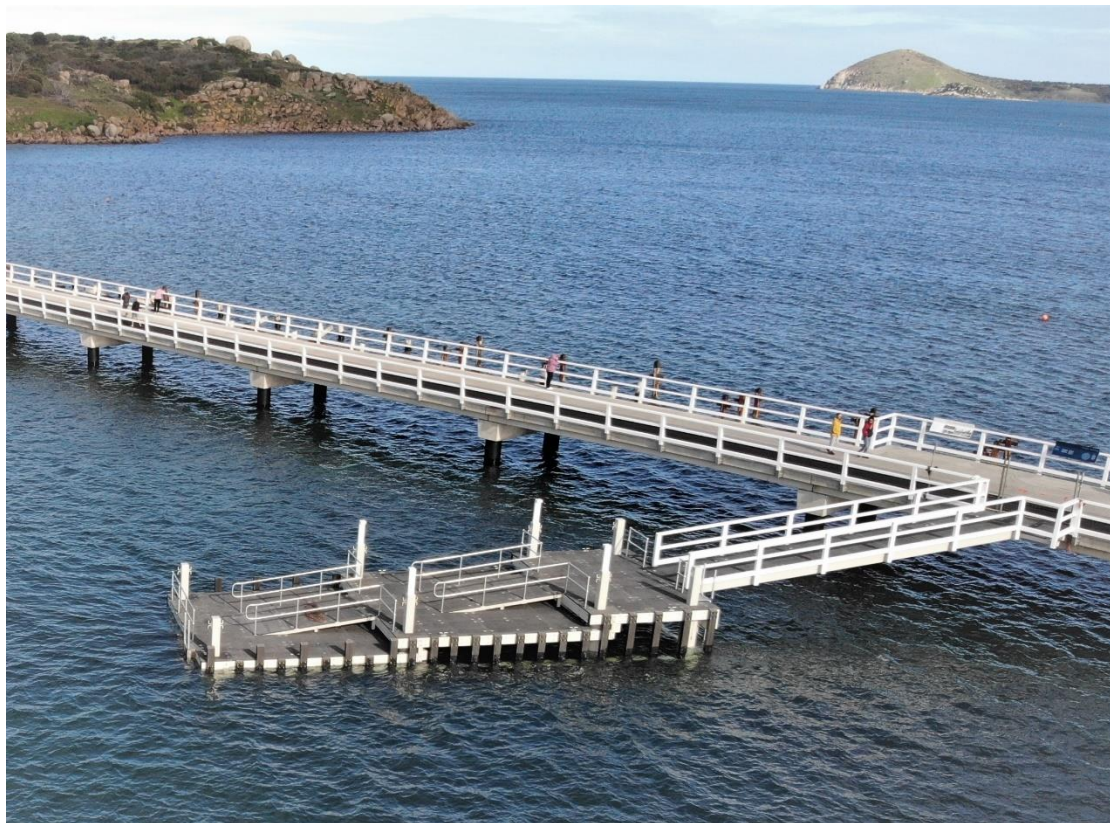
Photograph: Causeway at Granite Island.