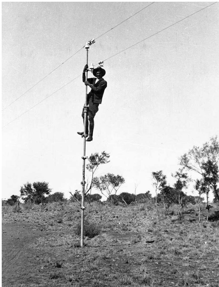
Photograph: Linesman on Overland Telegraph.

Bookings: festival.history.sa.gov.au/5712