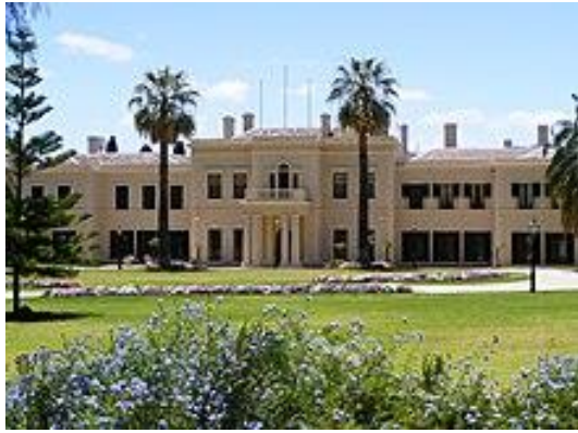
Photograph: Government House.