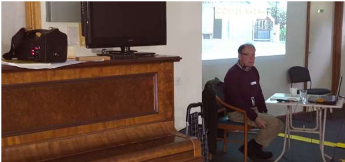
Promic amplifier in use during a presentation. (Speaker uses microphone as a collar)

Outcome: The students have reported a noticeably more relaxed presenter and a class full of renewed enthusiasm and energy. Both AH Writing classes are now at full capacity and further enrolees had to be waitlisted.